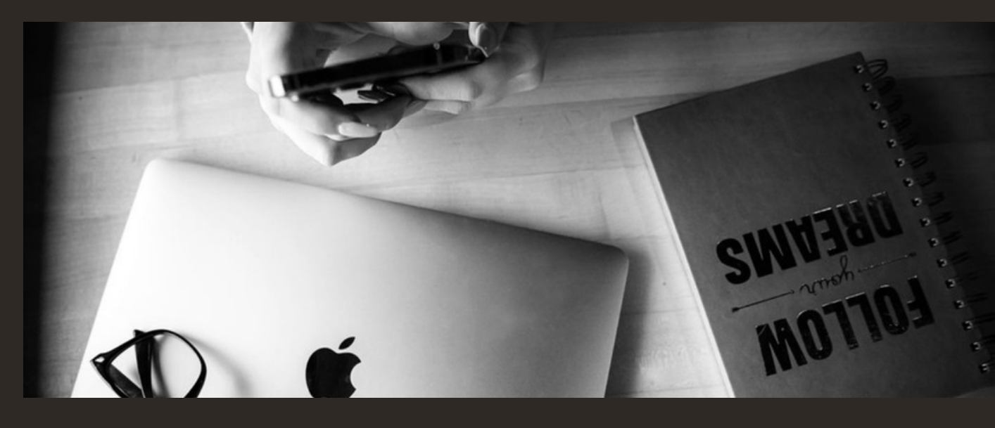
You Work — I Film. Simple as that.